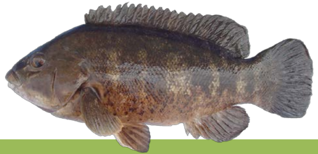
Tautog (Tautoga onitis)